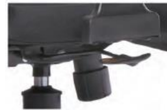
The unique imported spring syhncron mechanism technology allows single locking position to achieve perfect balance of seated position and assure maximum lumbar support spine