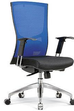
S22-03 980-1080(H)x570(W)x580(D) mm