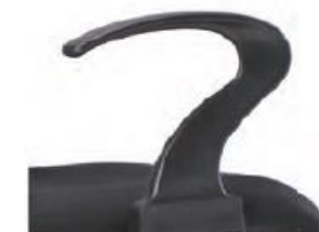
Stylist PP armrest is designed to suit your taste.