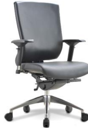
S23-03 1060-1160(H)x690(W)x690(D) mm