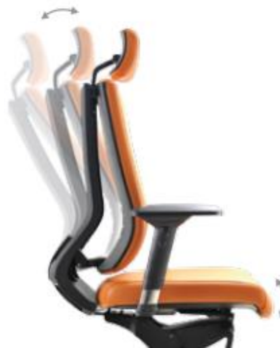
Synchronized mechanism technology allows 4 position locking system which follows the backward and forward motion of the user