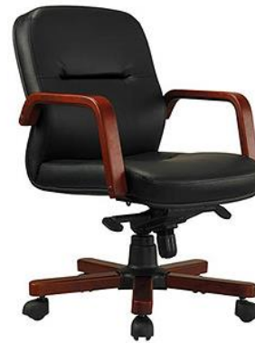
S17-03 950-1030(H)x620(W)x650(D) mm