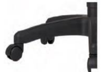
Nylon base with castor in nylon to enhance stability