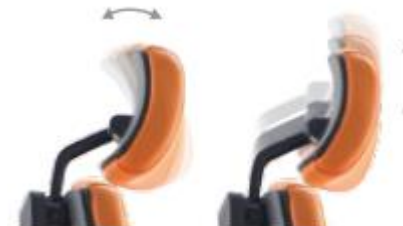
Multilevels & position headrest ensures you with great comfort