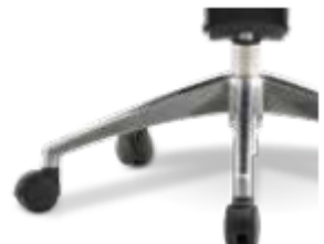
The 'ROCKET' aluminium die Cast base with heavy duty PU castors enhance stability of the chair