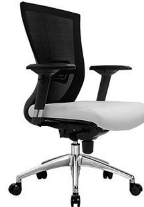
S14-03 1030-1130(H)x680(W)x600(D) mm