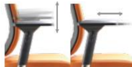
Height and depth adjustable armrest with swivel and top PU armpad in 7 locking position to suit individual preferences.