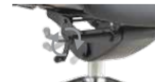
Imported unique synchronized mechanism with 360 degree turning tension control, multi position tilt lock and pneumatic Seat height control to providing maximum control.