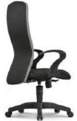
Backrest that is fashionable yet durable