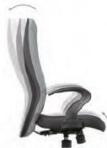
Synchronized mechanism technology allows single position locking system which follow the backwards and forwards motion of the user