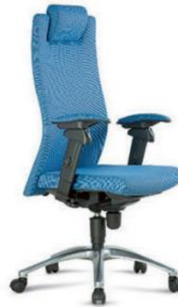
S19-01F 1100-1200(H)x580(W)x600(D) mm