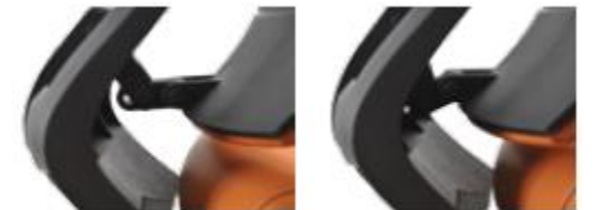
Adopting free tilting function in back, it support back all the way and help back rest by leaning back. If you push back, it will tittle for all the best comfortable.